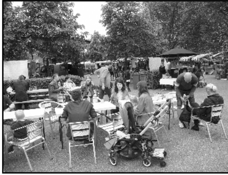
Food Market stalls can be seen in the background

Focus says: The food market in Coronation Gardens is an excellent addition to the Gardens and should bring many people and families into the park to enjoy the surroundings.