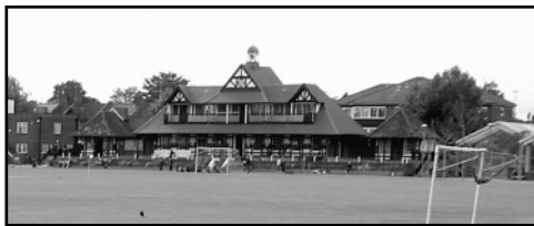
The historic pavilion at the Sports Ground

Focus is pleased to hear that a bid to the Heritage Lottery fund is being made to improve the facilities at Leyton Sports Ground . Currently a new boundary fence is being put up along Brewster Road and part of Crawley Road .