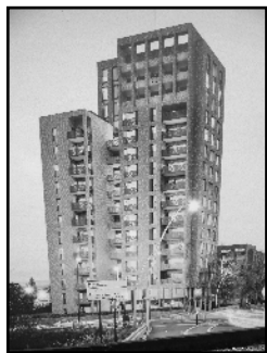
The ominous tower block picture

Focus says: The fact that residents voted in favour of a CPZ does not come as a surprise as these spread very quickly. Once some roads have one, all the nearby roads suffer from parking problems. To enable residents to park their cars in their road they are forced to agree a CPZ. This latest one will now affect Goldsmith Road, Oliver Close and the roads off Church Road which do not have a CPZ.