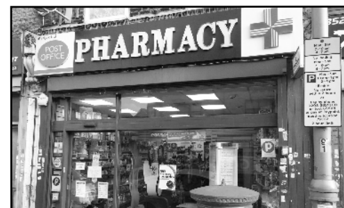
Leyton High Road Pharmacy

We now have over 1,500 signatures for our petition against the cuts to our local pharmacies. Focus is finalising the latest returns before we send in our petition. A big 'Thank You' to those of you who have signed. You can still sign our petition online at: