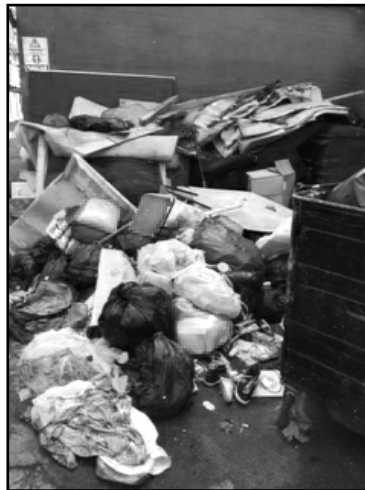
Rubbish dumped at the rear of Station Parade in Coopers Lane

Call to book a collection on 020 8496 3000.