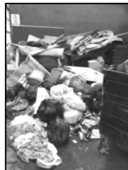
Rubbish flytipped at the rear of Station Parade

The problem of rubbish dumped in the entrance to the Station Parade block of flats at the corner of Coopers Lane and the High Road continues.