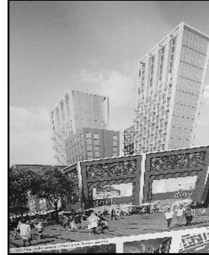
Artist's impression of the development

Tower blocks approved for Walthamstow Town Square